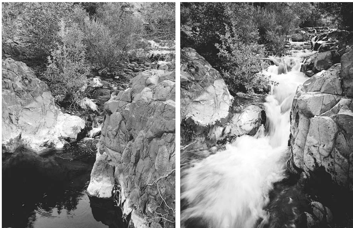
PLATE 1. Typical flow and riparian zone of Fossil Creek, Arizona, USA, before (left panel) and after (right panel) return of full flow to the river following decommissioning of the 100-year old hydropower dam in June 2005 by Arizona Public Service, the power company that operated the hydropower facility. Stable isotope samples collected for this study were collected before decommissioning.

both allochthonous and autochthonous sources of productivity are present. Laboratory investigation of drinking water, trophic fractionation, and other possible influences on organic hydrogen isotopic composition will help refine this technique. The survey data we report here should also be expanded to include a broader range of terrestrial and freshwater algal species, and other watersheds outside of the southwestern United States, particularly in more mesic climates. Nevertheless, given the large differences we observed in \delta D between algae and terrestrial organic matter, we submit this technique holds considerable promise for addressing hypotheses about energy flow in aquatic ecosystems.